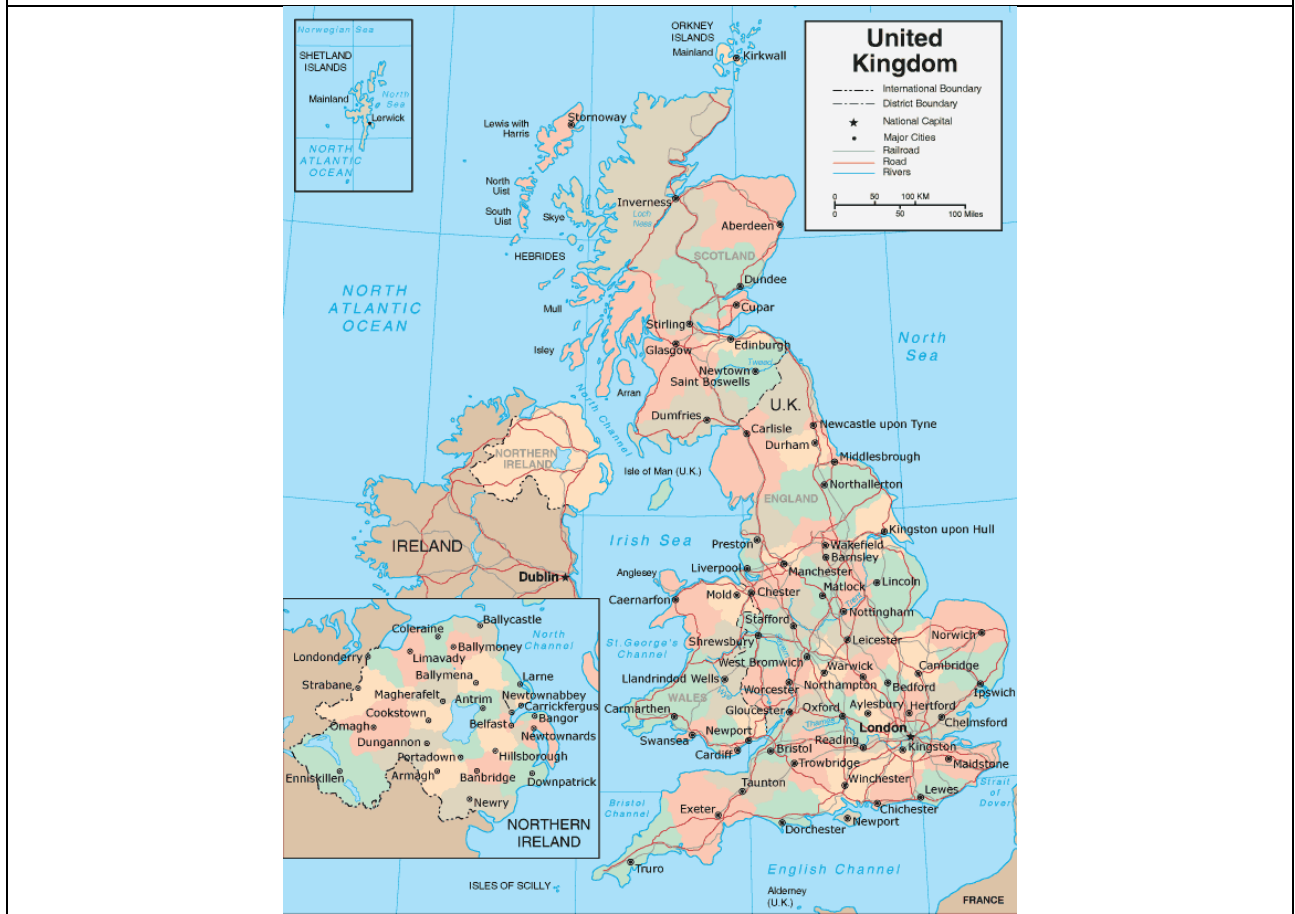
MAP OF THE UK

GEOGRAPHY: What will we see on our journey around the world? Y2 SPRING TERM